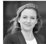
AXELLE LEMAIRE Deputy French Minister of Digital Affairs