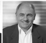
JEAN-LOUIS MESSIKA Deputy Mayor of Paris